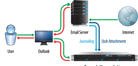
Barracuda Message Archiver

Exchange Stubbing. Organizations that are reaching the limit on their email server disk space can immediately alleviate their storage pressures through Exchange stubbing. Message attachments are moved to the Barracuda Message Archiver and can be seamlessly accessed via a link to the storage archives. Organizations have full control by customizing how and when messages are stubbed. Users can also unstub attachments enabling full offline access.